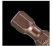
Quick Change Groove