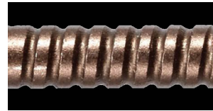
Spirals Absorb Impact US Pat. 7,437,979 B1