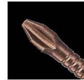
Tips are CNC Machined