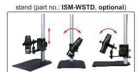
stand (part no.: ISM-WSTD, optional)